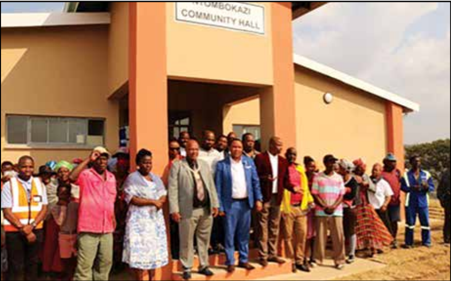
The Mthonjaneni Municipality leadership along with the community in front of the new Ntombokazi Community Hall.