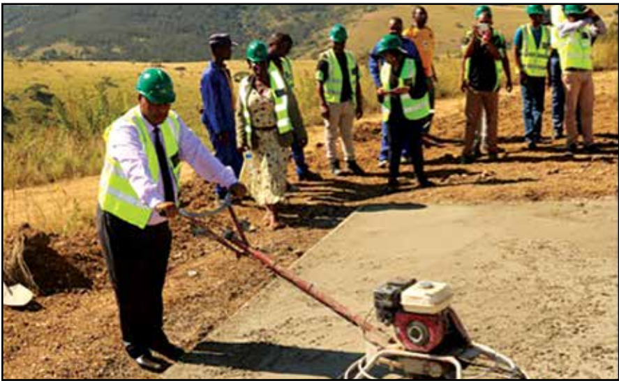
His Worship the Mayor Cllr Sbhonginkosi Biyela operating the machine at one of the sights of the new RDP houses under construction.

delegation found that some houses are near completion. Mayor Biyela said although the Department of Human Settlement is in charge of the building of the RDP houses, Mthonjaneni Municipality is also contributing towards infrastructure development in the area. “Our Municipality will contribute R15 million towards assisting with electricity installation and the upgrade of roads in the township,” said Mayor Biyela.