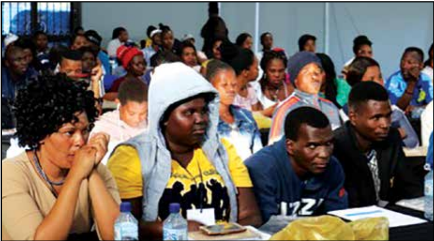
Some of the youth delegates listening alternatively on His Worship the Mayor address.