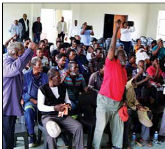
Some of Noziphiva community members who attended the Sod Turning event.