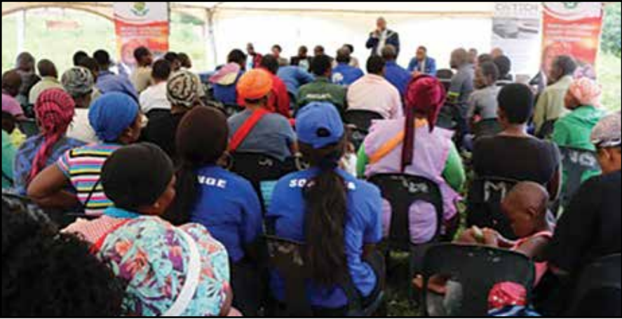
His Worship the Mayor Address the Zigagayi Community during the Mehlamasha Community Hall sod turning.