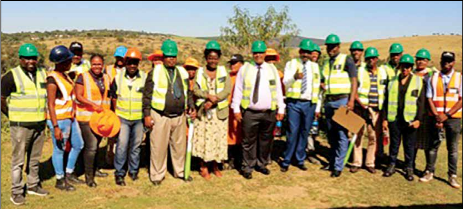
Municipal Council and officials led by his worship the Mayor Cllr Sbhonginkosi Biyela the contractors on site.