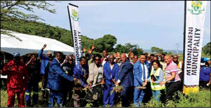
The Leadership turn a sod for Mehlamasha Community Hall.