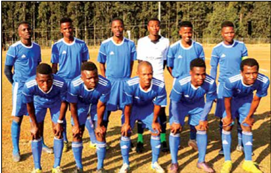
The Mthonjaneni Blue Stars who played against the AmaZulu FC during the Mayoral Cup.