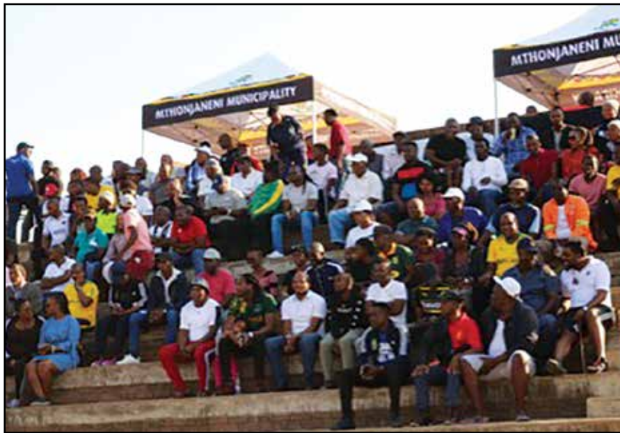
Spectators who attended the Mayoral Cup in Mthonjaneni at the Melmoth Sports Field.