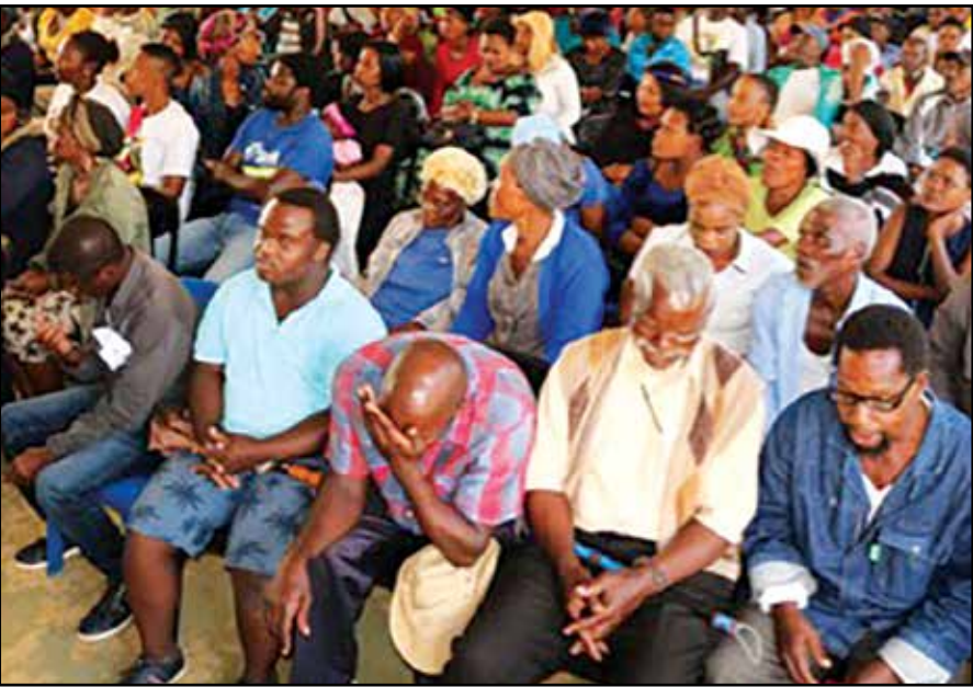
Some of Ward 12 community attending an IDP Imbizo at Mawanda Community Hall.