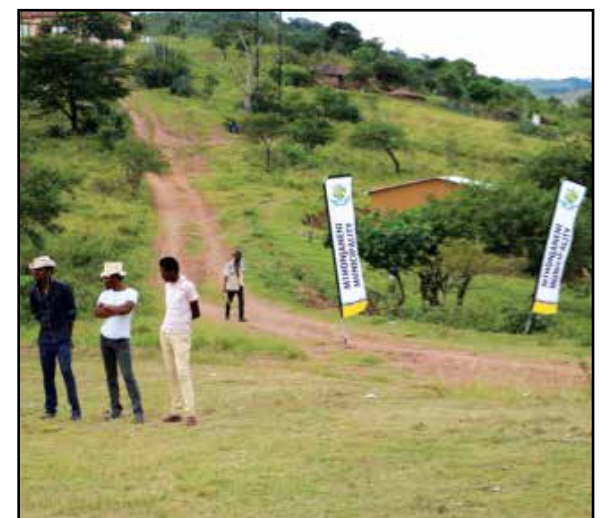
Noziphiva gravel road that will be upgraded for the community.