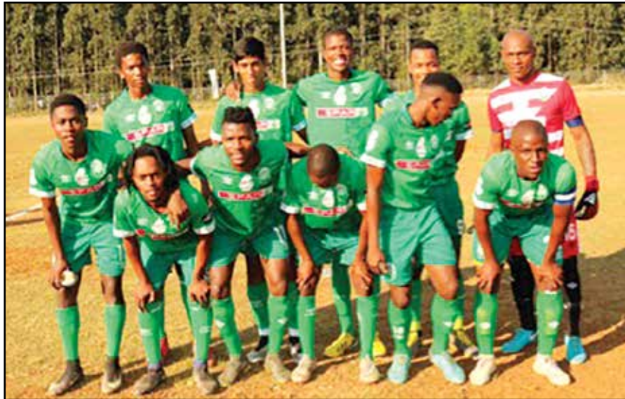
AmaZulu Reserve team who were part of the Mthonjaneni Mayoral Cup.