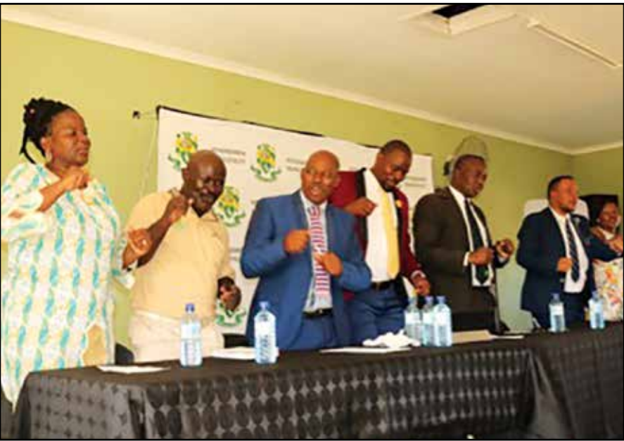
Mthonjaneni leadership singing before the start of an IDP Meeting.