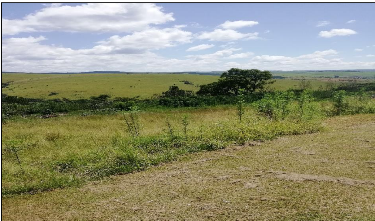
SITE PHOTO SHOWING ERVEN 2371 TO 2378