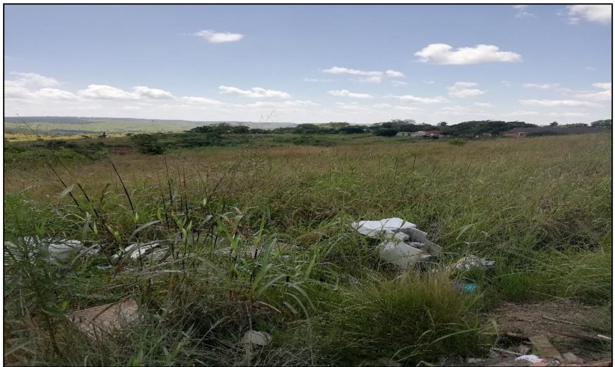
SITE PHOTOS SHOWING ERVEN 2361 TO 2370