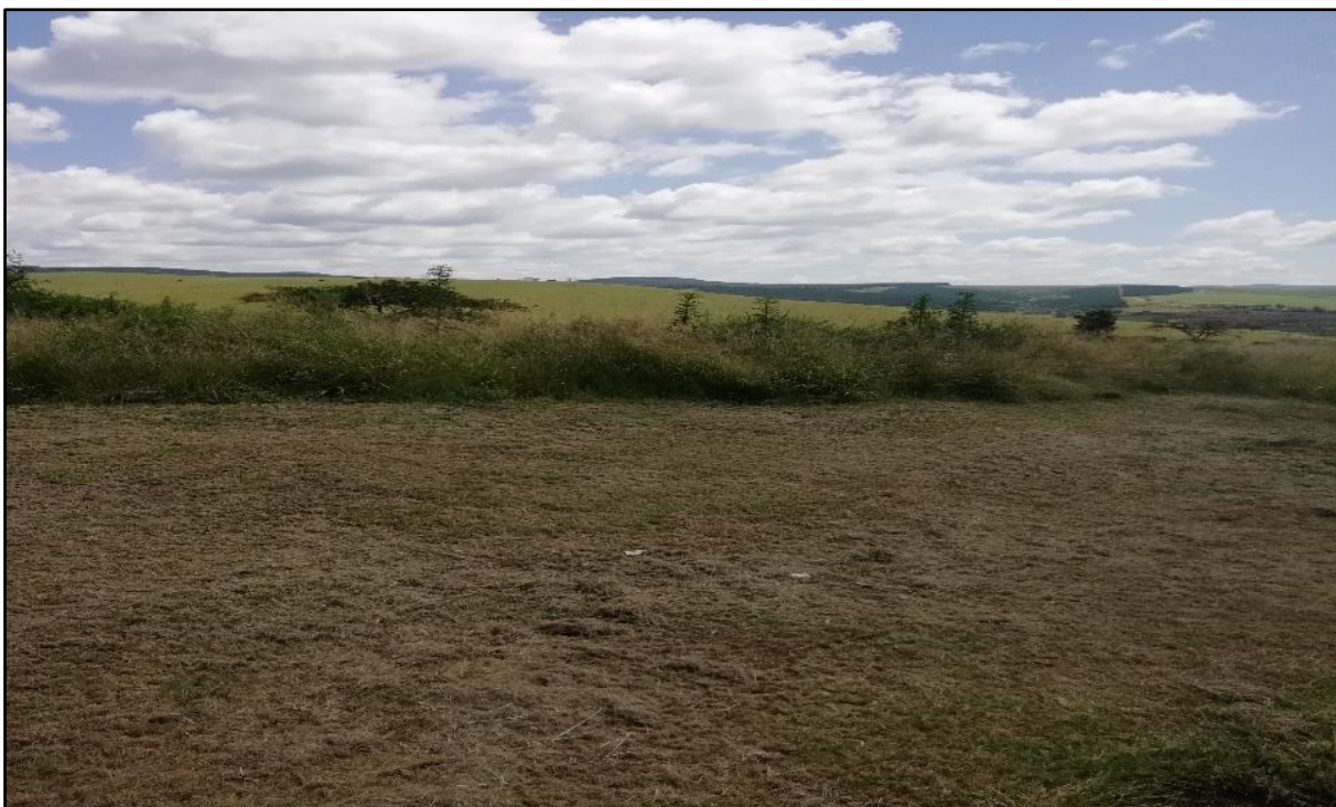
SITE PHOTO SHOWING ERVEN 2380 TO 2389