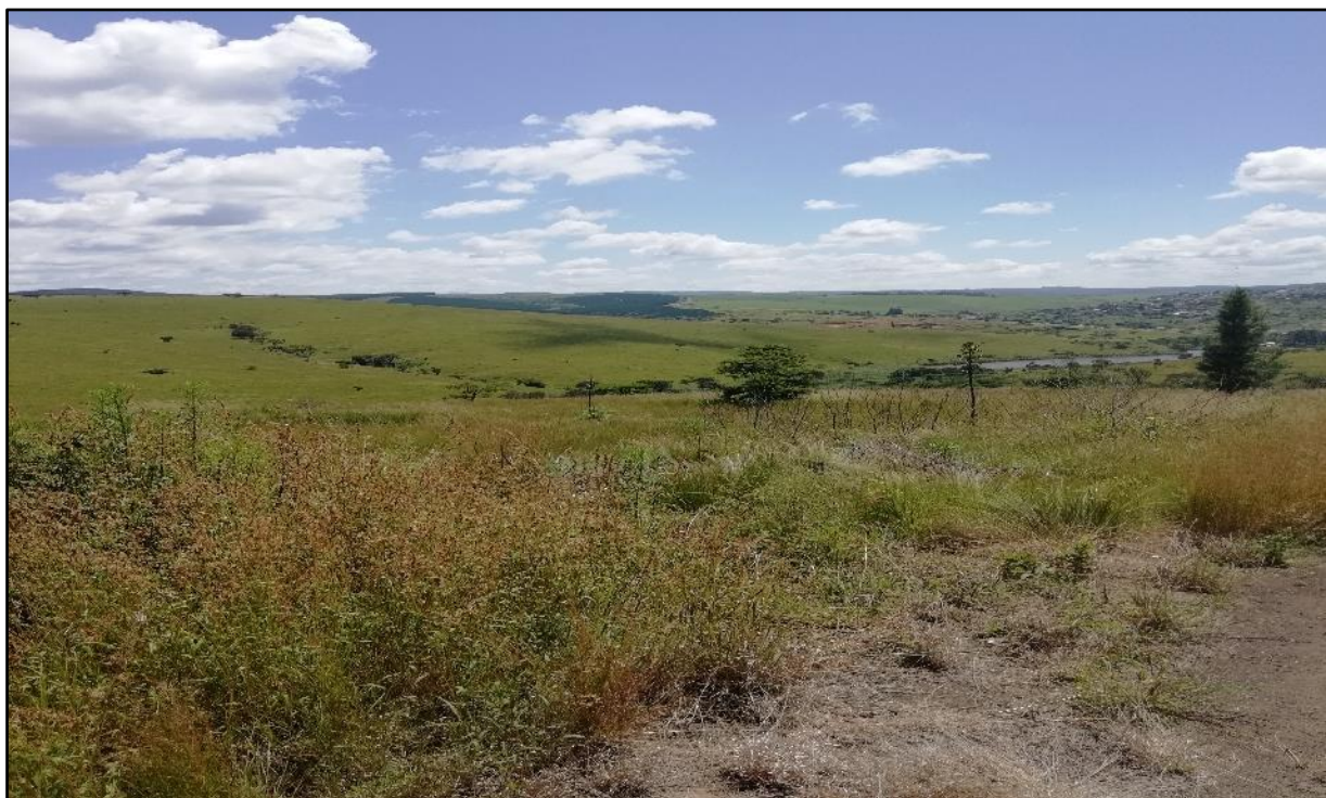
SITE PHOTO SHOWING ERF 2379