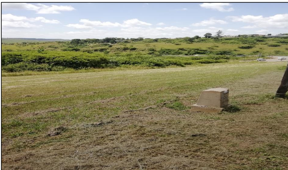
SITE PHOTO SHOWING ERVEN 2390 TO 2396