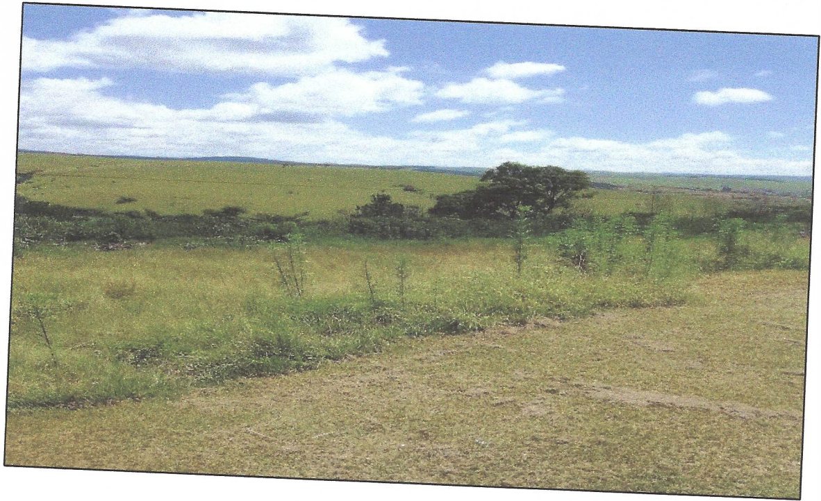
SITE PHOTO SHOWING ERVEN 2371 TO 2378