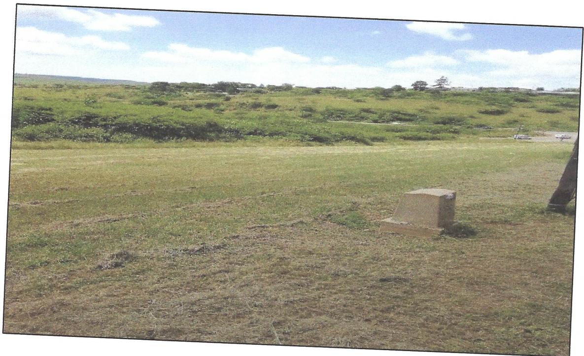
SITE PHOTO SHOWING ERVEN 2390 TO 2396