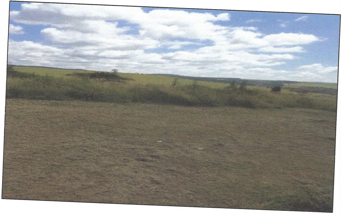
SITE PHOTO SHOWING ERVEN 2380 TO 2389