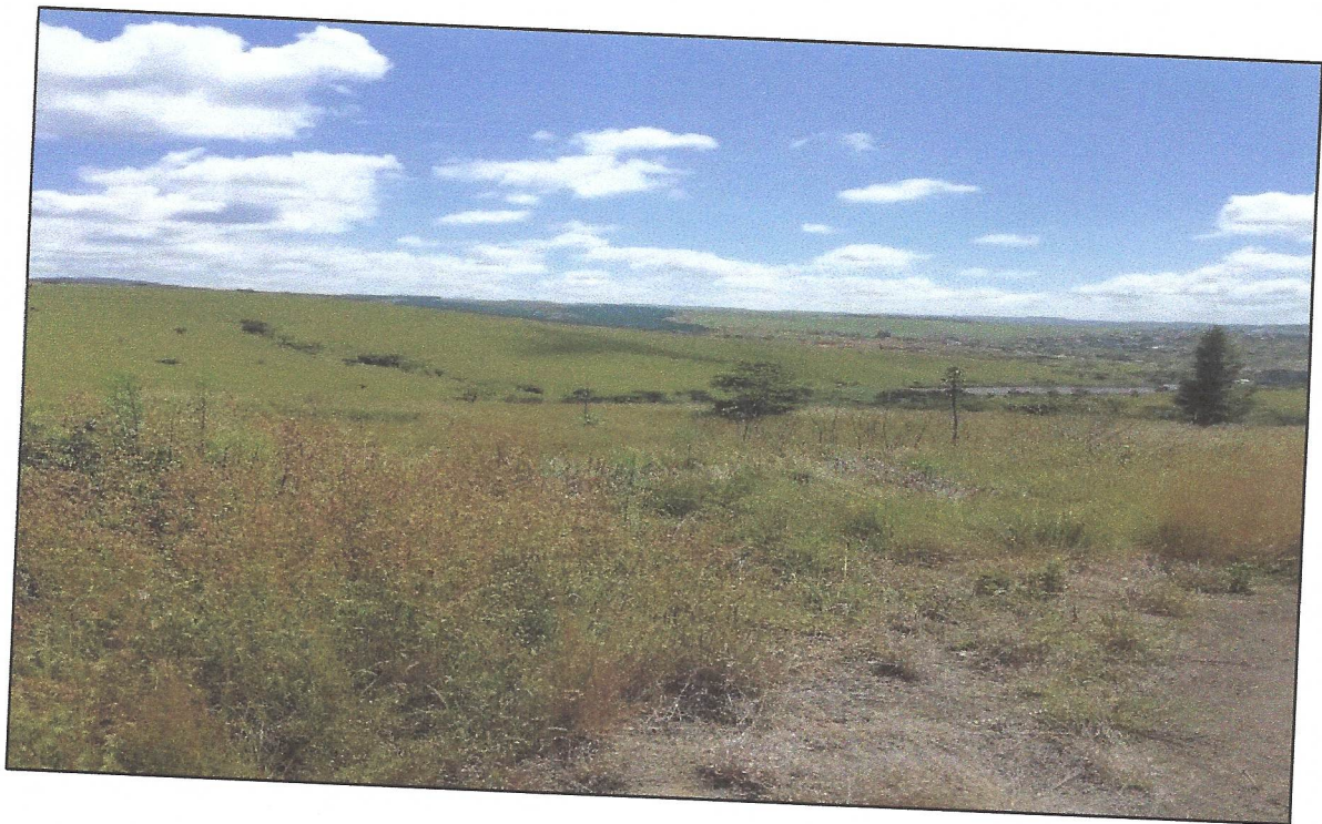
SITE PHOTO SHOWING ERF 2379