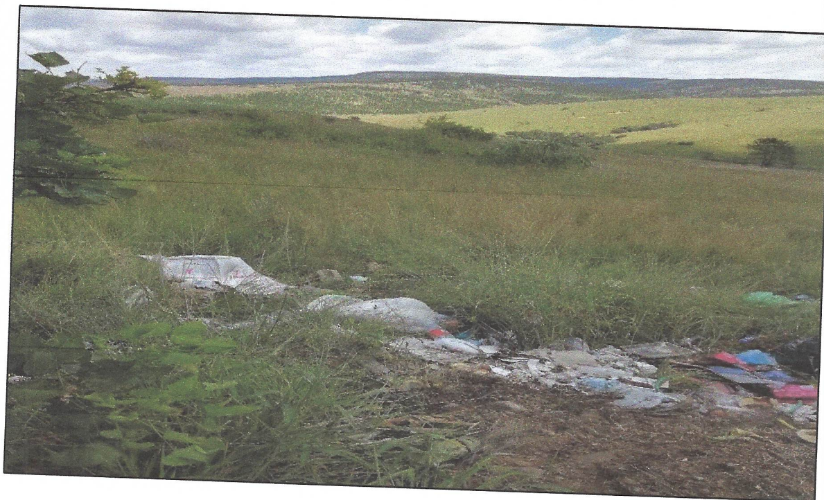
SITE PHOTO SHOWING ERVEN 2357 TO 2360