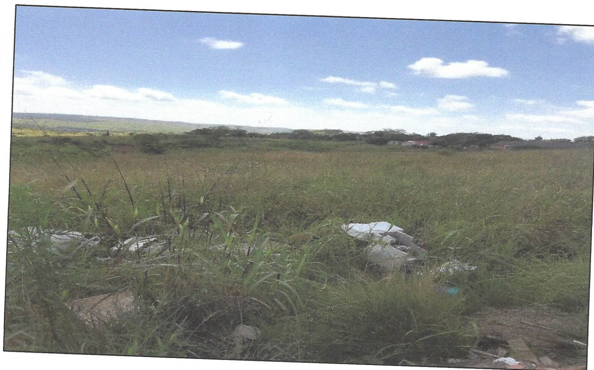
SITE PHOTOS SHOWING ERVEN 2361 TO 2370